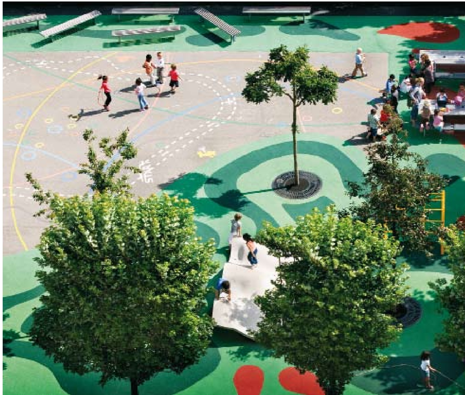
↑ | Top view of "secret garden" and sports area

Address: Mullerkade 173, 3024 EH Rotterdam, The Netherlands. Client: Municipality of Rotterdam. Completion: 2007. Materials: concrete, rubber (flooring) and metal. Theme: secret garden.