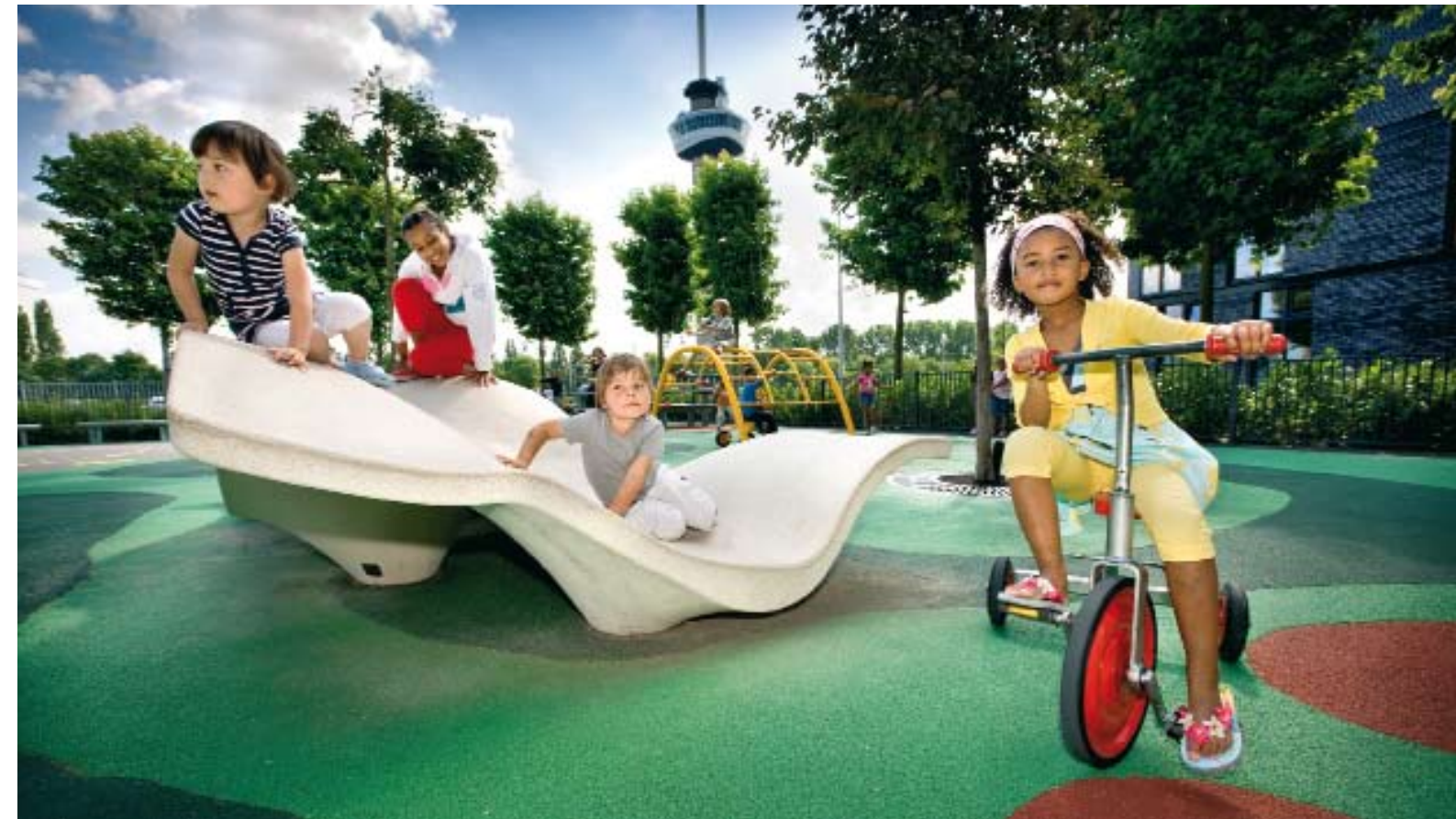
↑ | "Secret garden" play area ↓ | Children ride their bikes following the colorful paths