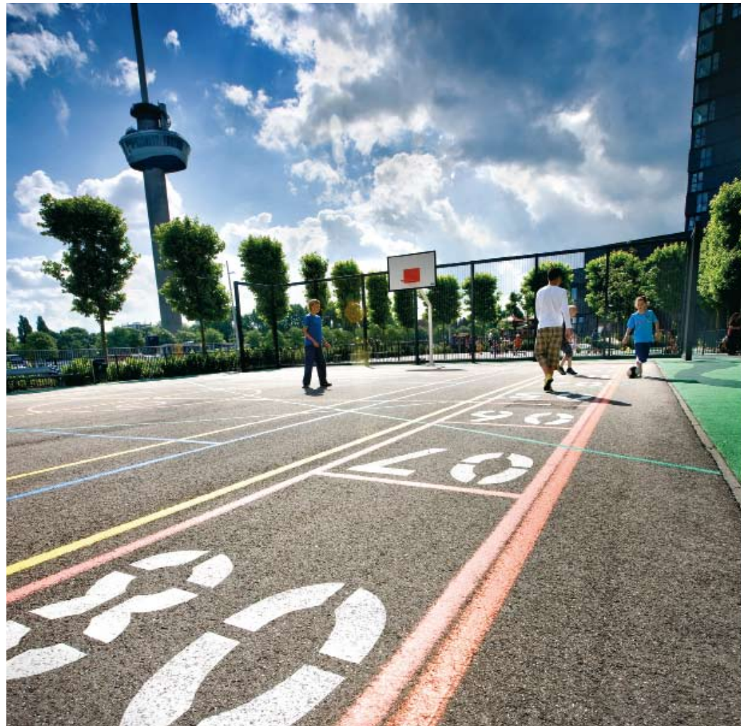
↑ | Site plan ← | Sports courtyard